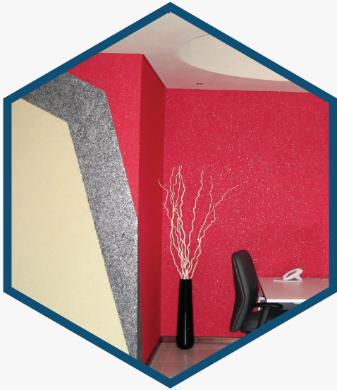
Natural Wall Coating