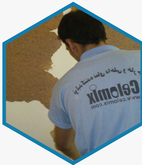
Design Services & Implementation