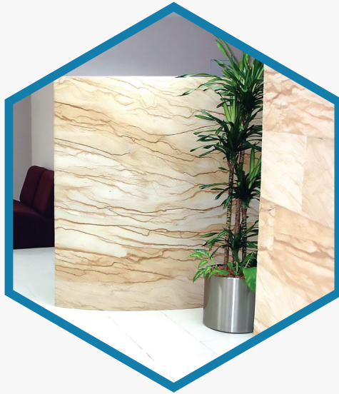
Flexible Stone Cover