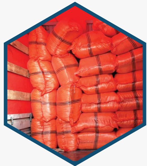
Selling Raw Materials