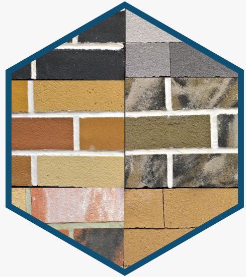
Decorative Flexible Bricks